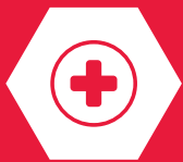
Unlimited Health Check Reports for Management