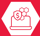
Honeypot Trap & Alerts