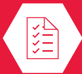
Systems Security Protection