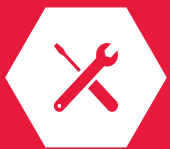
Device Warranty 1-to-1 Exchange