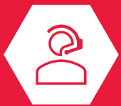
Specialised Consultancy & Support